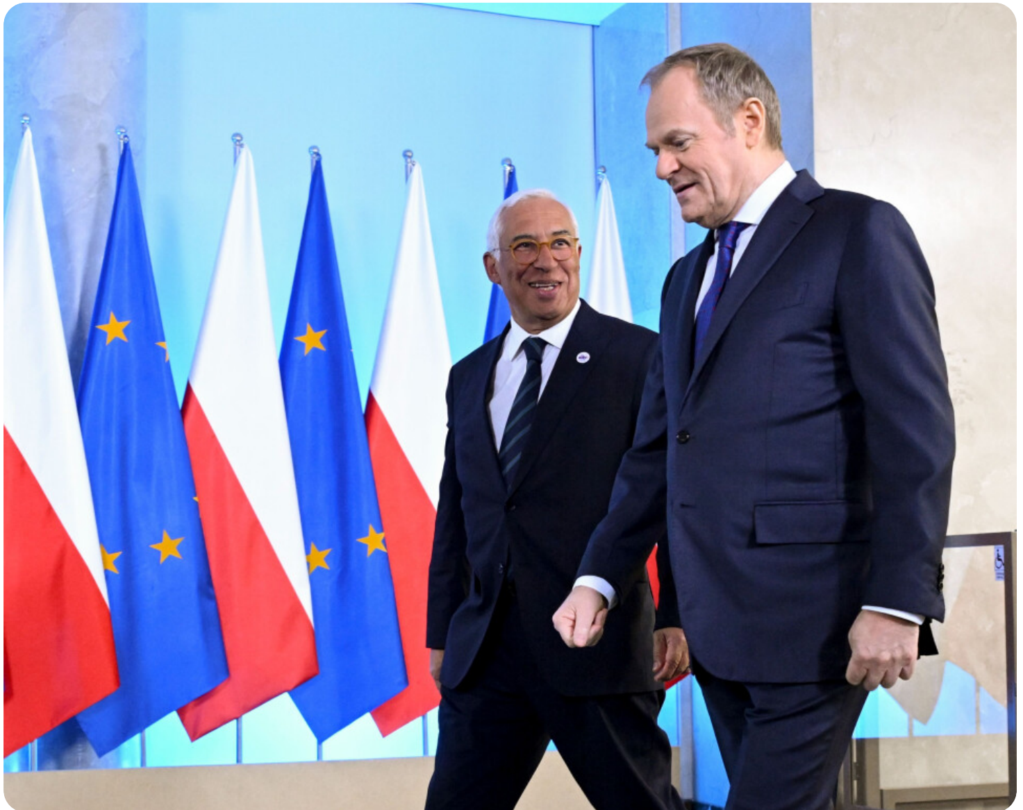
Poland, Denmark and Cyprus